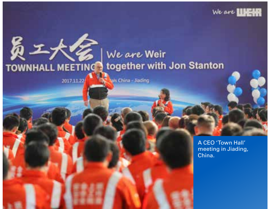
A CEO 'Town Hall' meeting in Jiading, China.